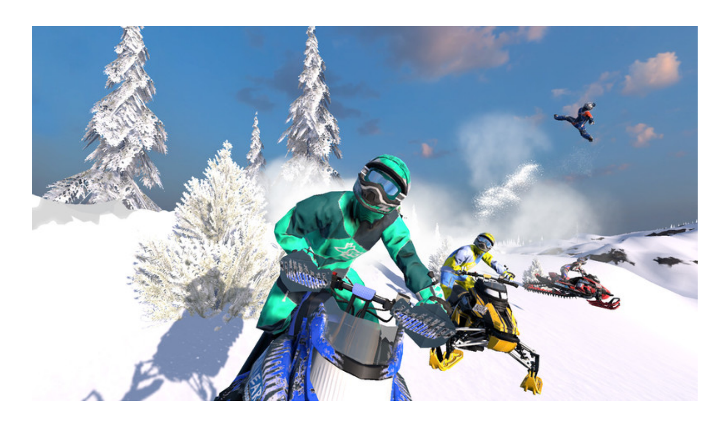
Snow Moto Racing Freedom Download For PS4

Download >>> <u>http://bit.ly/2JnGdZp</u>